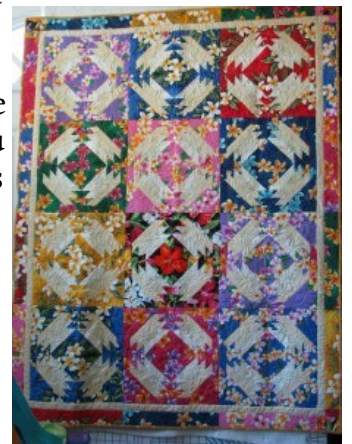
Marie's Hawaiian Pineapple

A rotary cutting ruler with a 45 degree line marked on it Rotary cutting equipment Neutral thread Sewing machine Basic sewing supplies